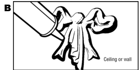
Apply paintable caulk to edges